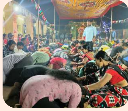
MATRU PITRU PUJAN DIVAS