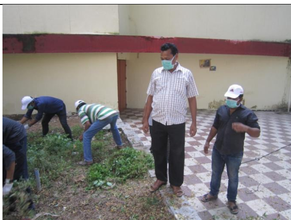
Campus cleaning by Staff and SSG students