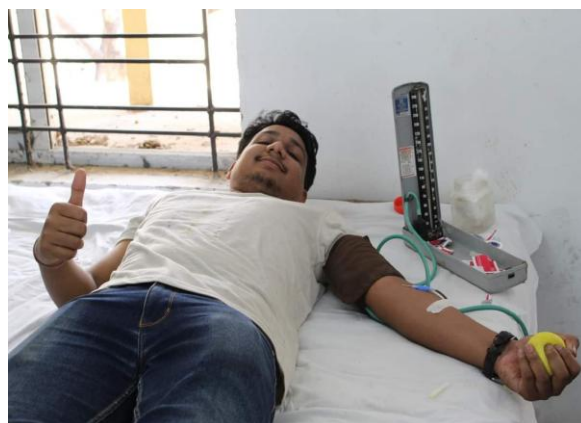
Blood Donation Camp at VSSUT, Burla