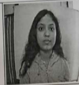
Test Day Photo

Candidate's Contact Details : Qrs. No. - E/45, Koelnagar