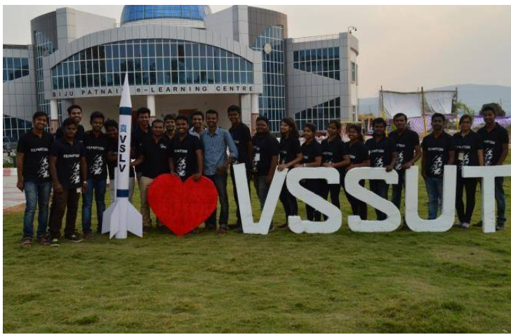
Students with VSLV Satellite Model