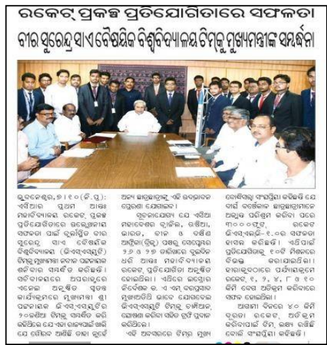
Group meeting of students and faculty