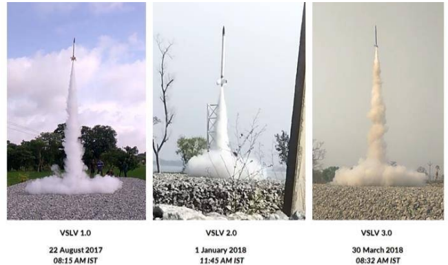
Launching of VSLV Satellite upto 4km