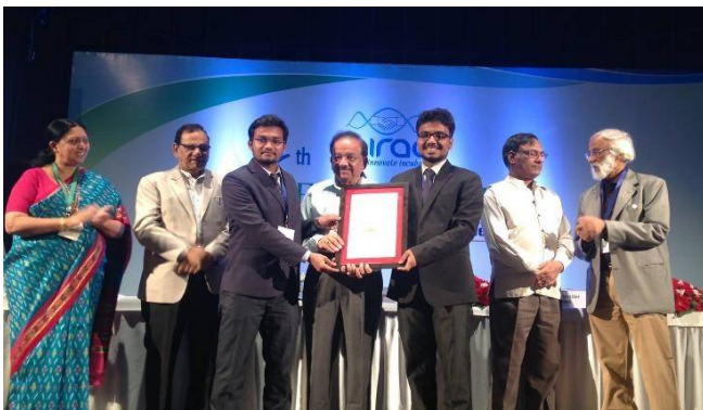
Winner of 15 Lakhs award in DST Birac Innovation Challenge and Student Winners at Sochi Russia World Youth Festival