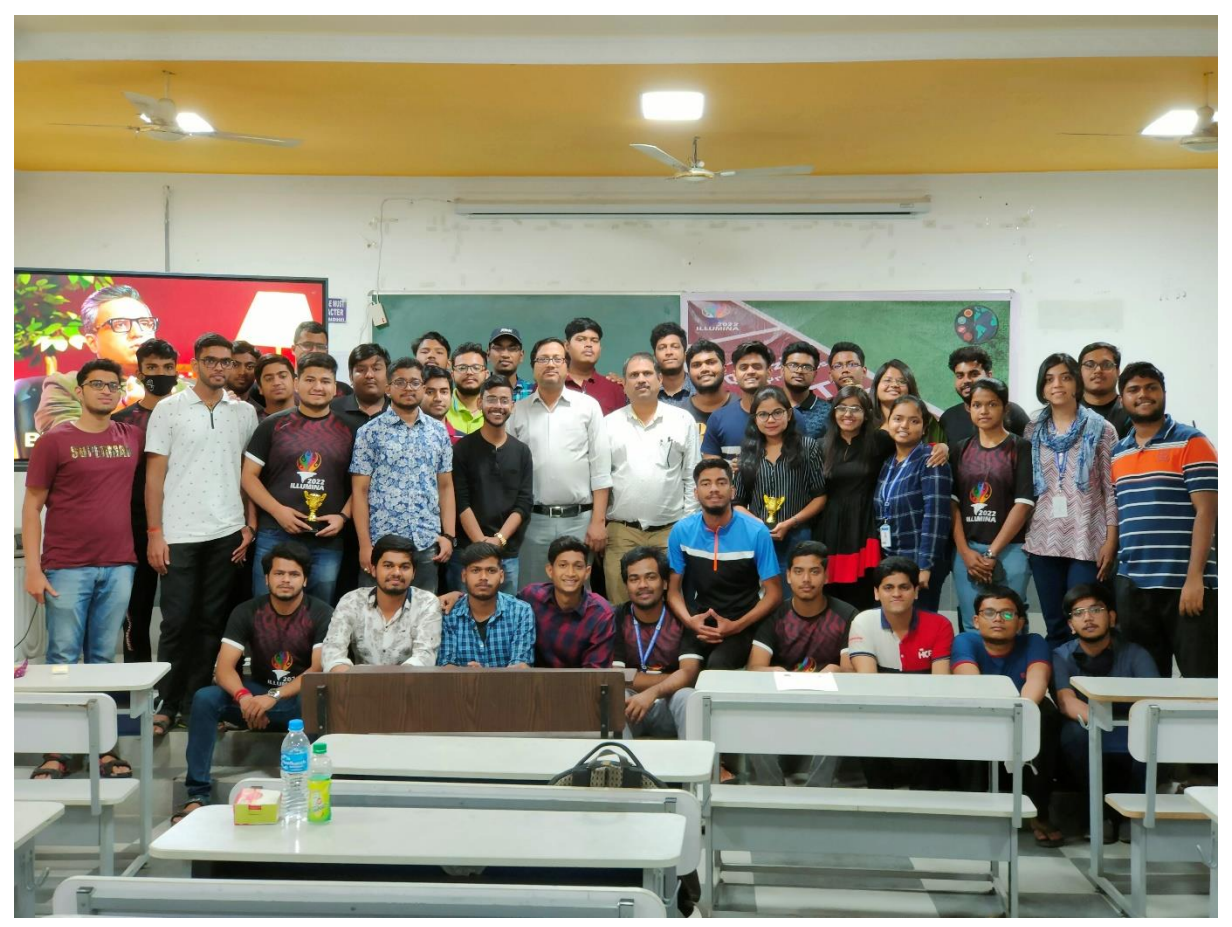
Quiz event during annual cultural festival VASSAUNT March 2023