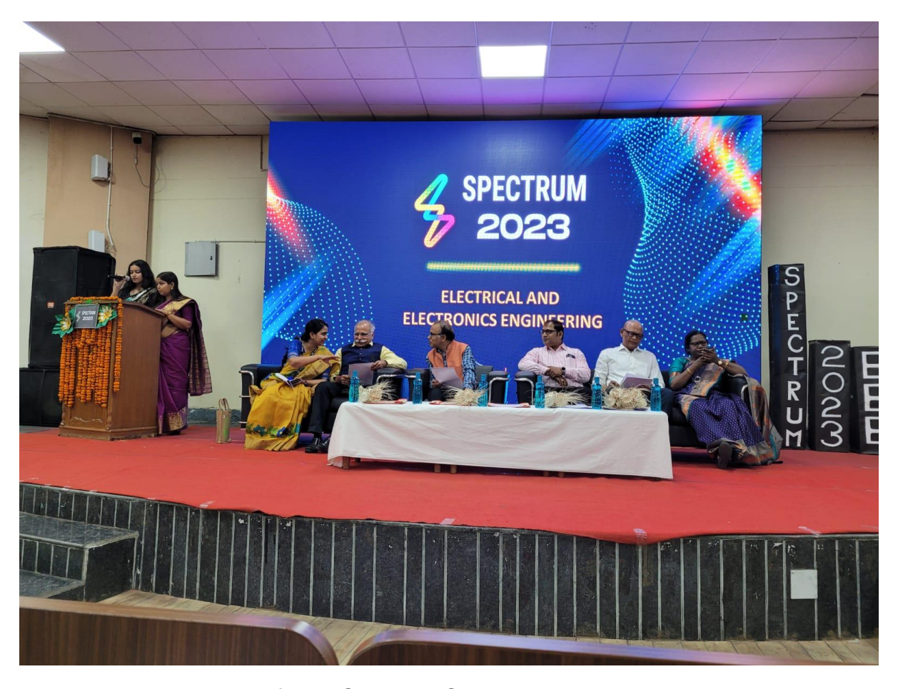
Annual Technical event of EEE Students, Society April 2023