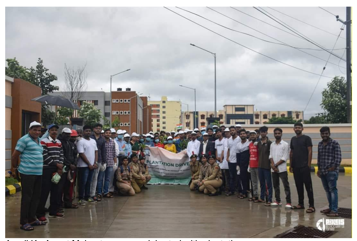
Azadi Ka Amrut Mohoutsav was celebrated with plantation