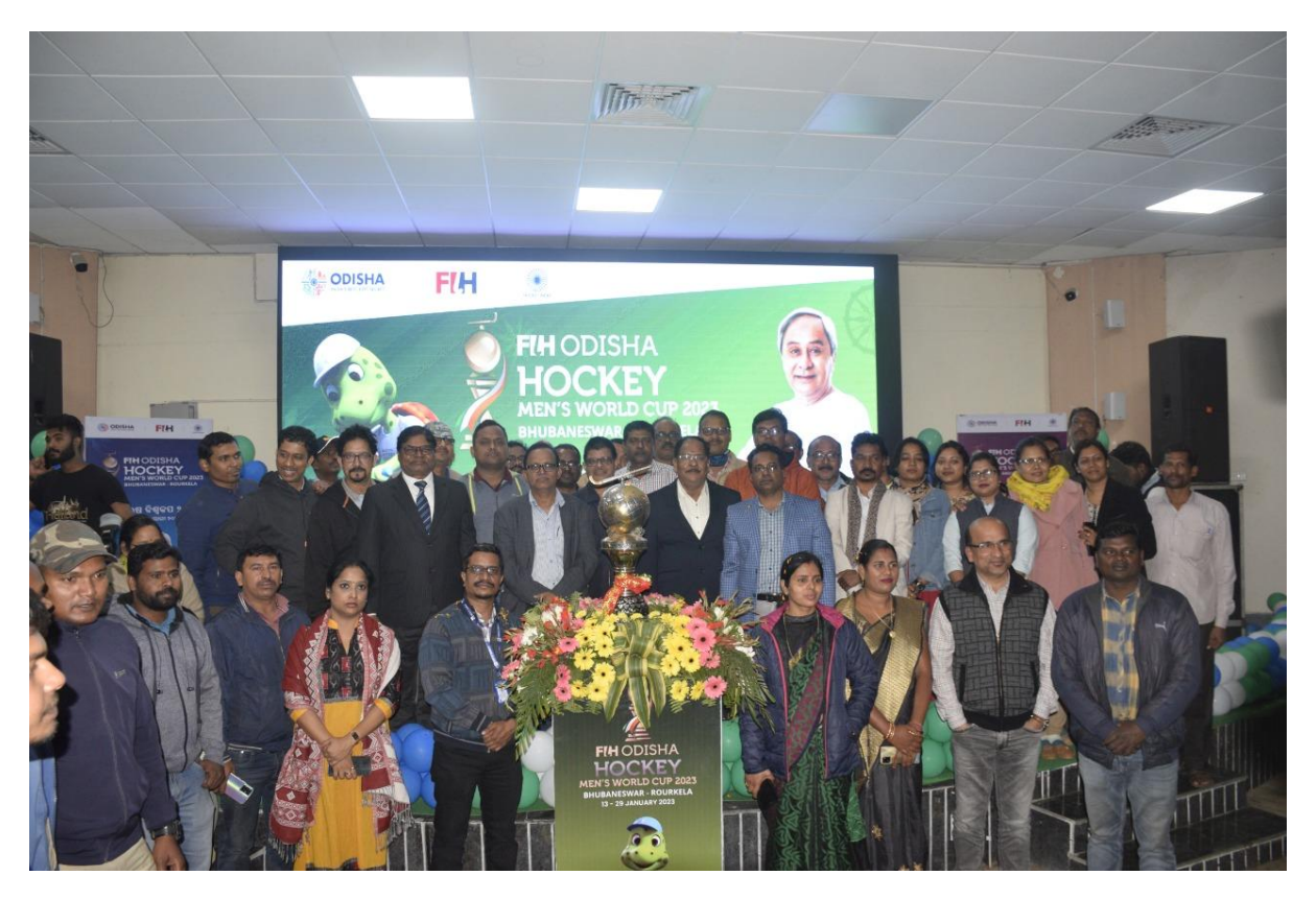
Welcome of Hockey World Cup at VSSUT on 3^{\rm rd} Jan 23