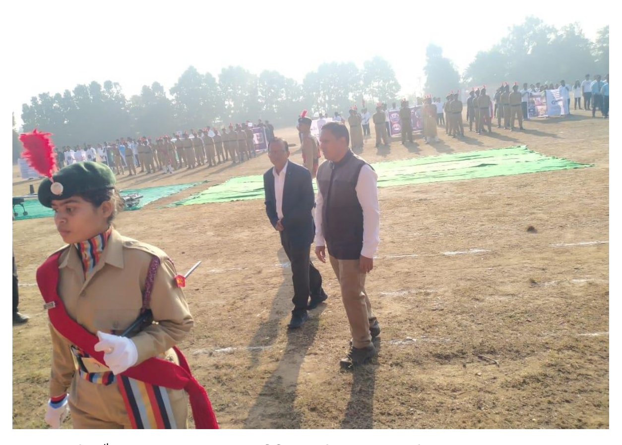
Parade of 26<sup>th</sup> January 2023 with NCC, and flex display of all students clubs