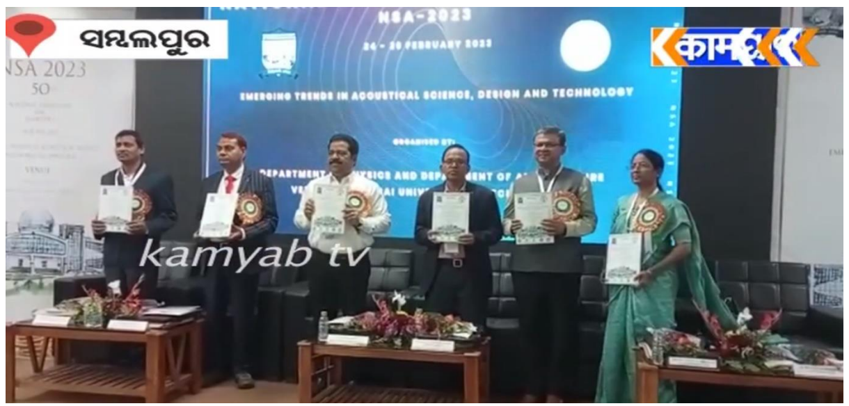
Conference NSA 2023 by Acoustical Society of India24-25th Feb 23

https://www.facebook.com/100107181348885/posts/pfbid021zYquf6uGk9f2KUxYPktdt1Hz4mAbFbSpHcGjMHDjCmaxCgdE72tPSqVHD1wUEmfl/?sfnsn=wiwspwa