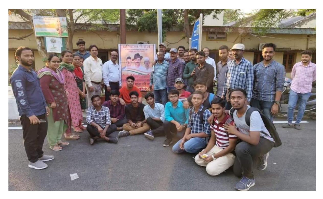
Balidan Diwas Dt.23.3.23