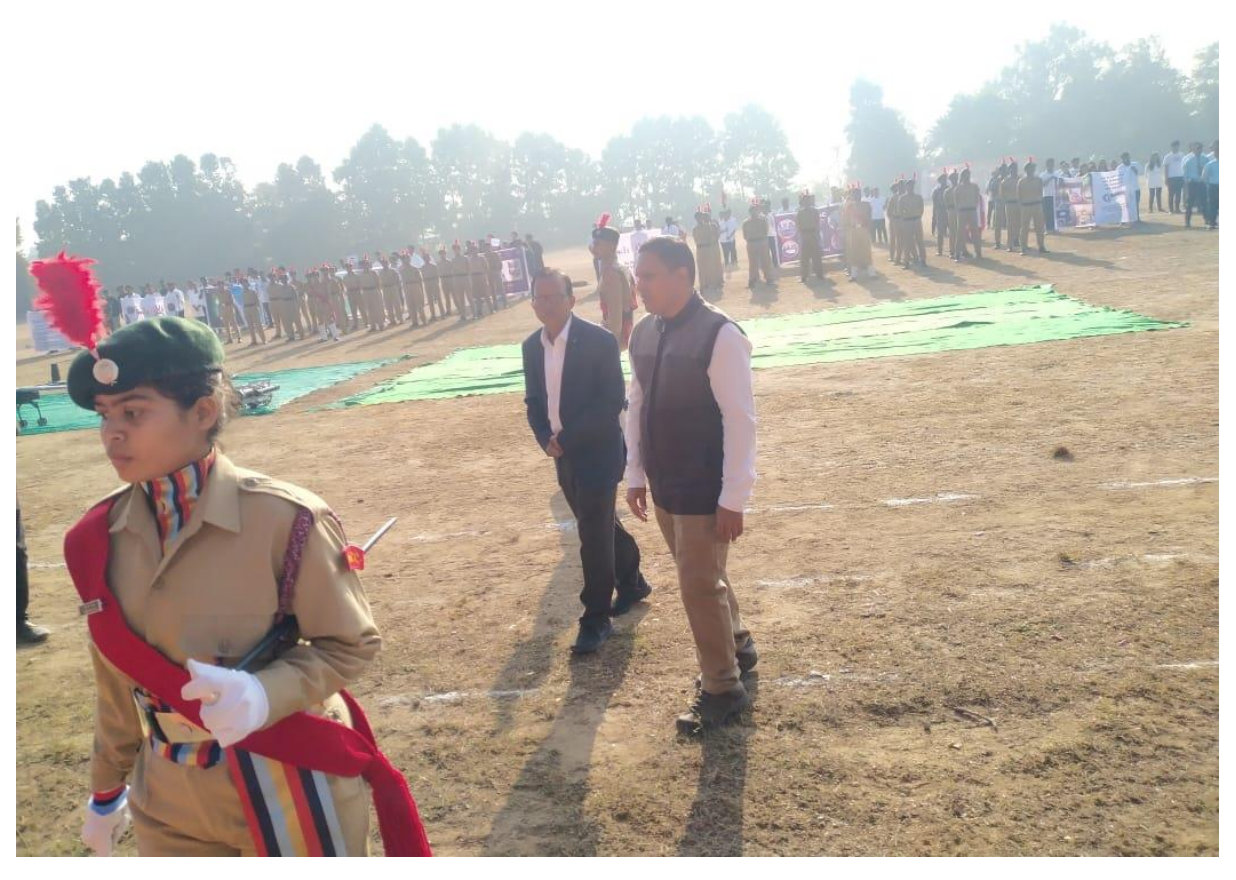
Parade of 26<sup>th</sup> January 2023 with NCC, and flex display of all students clubs