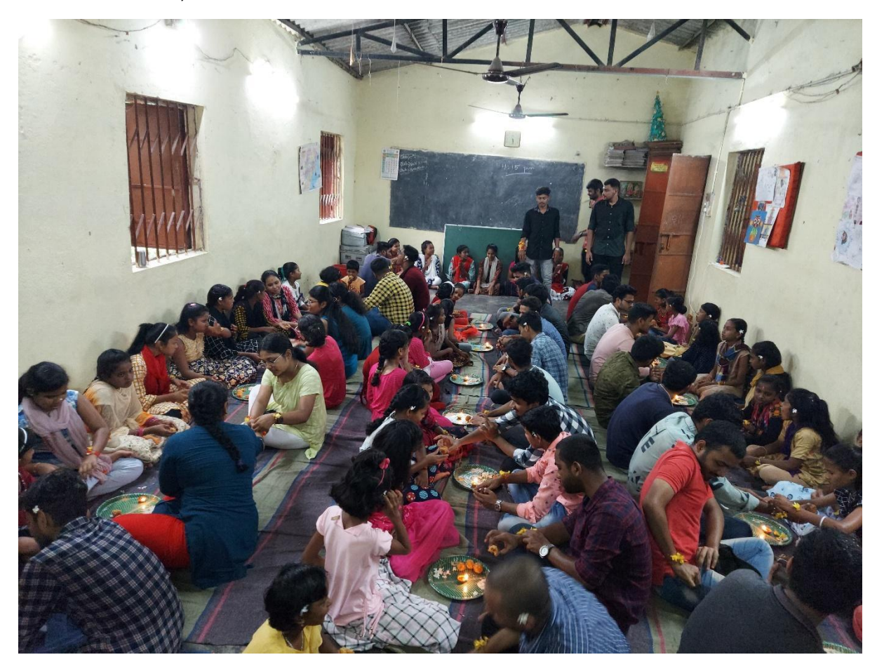
Rakshabandhan at Sanskar Kendra in Kirba village by SSG Society VSSUT