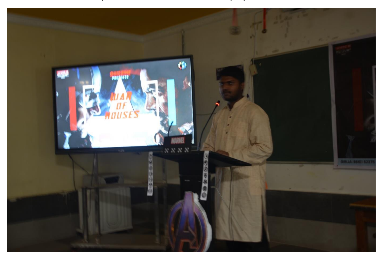
Quiz event during VASSAUNT March 2023