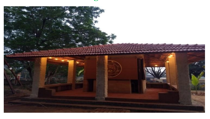
Low cost rammed earth building for coffee center