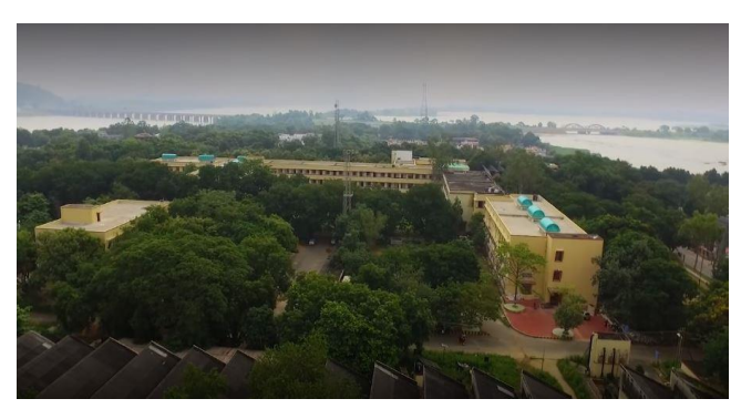
Birds eye view of academic block