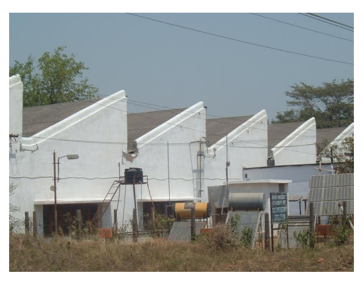
Solar cell in the University campus