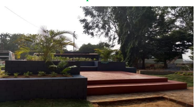
Landscaping near auditorium