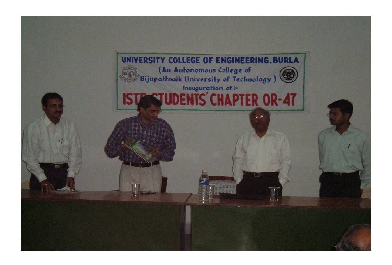
Inauguration of Students' Chapter OR-47