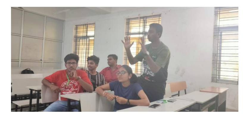
Photograph during the Debate Competition