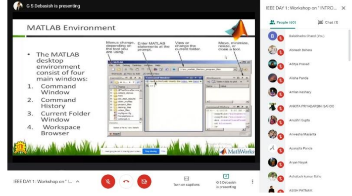
Photograph during the Workshop

The unveiling of the events by IEEE VSSUT BURLA STUDENT BRANCH on the occasion of IEEE DAY was done on 5th October 2020 through a workshop. The workshop was on "Introduction to MATLAB and Simulink" and was done in collaboration with Central Tool Room and Training Centre, Bhubaneswar. The workshop started at 3:00 PM and was chaired by G S Debasish of CTTC. The workshop saw a huge response with 56 participants and it covered all the basics of MATLAB and Simulink starting from 2d and 3d plotting to solving various kinds of equations. The practical demonstration was the star of the event followed by an interactive question-answer session. The one to add glitter to this star is the live streaming of the entire event on YouTube.With spirit up in the air, the event became a great success!