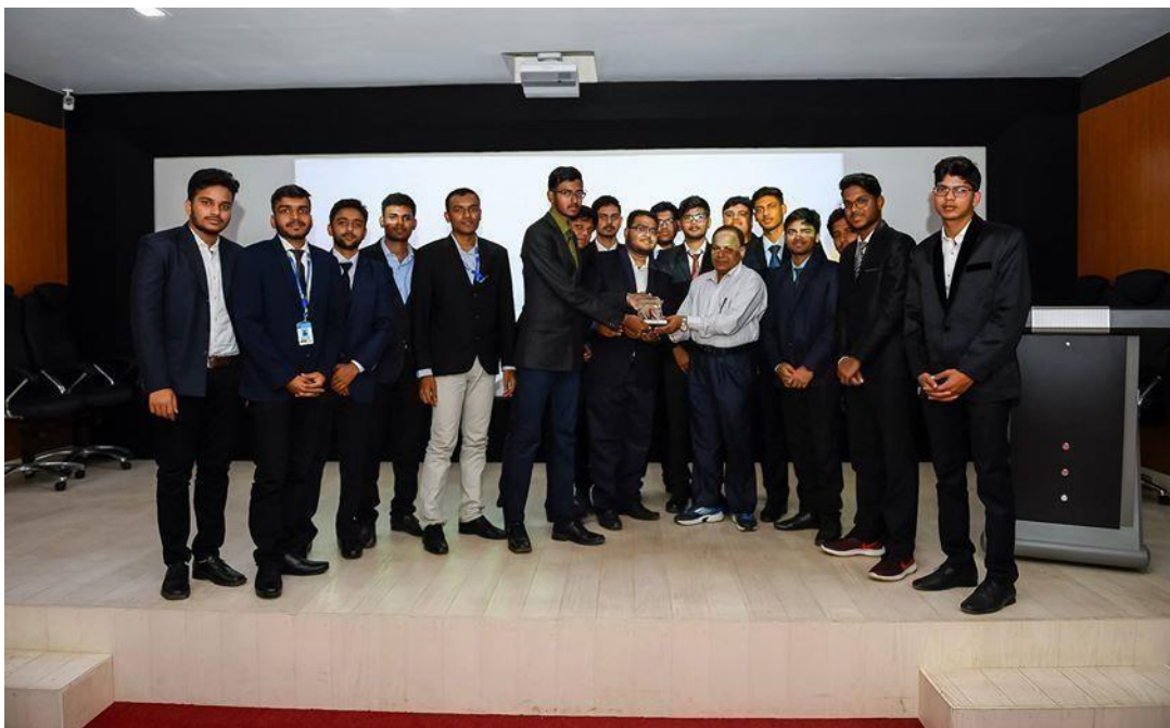
VSSUT Student Satellite Team at One day visit at DRDO Integrated Test Range Chandipur on 19 th December 2018. Our Team visited the Optical centre, Radar unit, Mission control centre, Launch complex, bird sanctuary and deer Park, Range HQ. We also witnessed a live launch of small missile of 3km range.