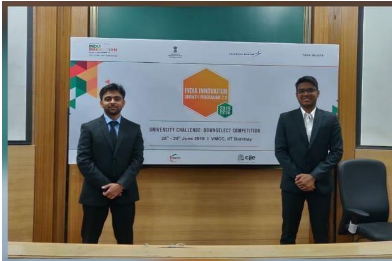
Among the top 20 winners of IIGP 2.0 University Challenge 2019.