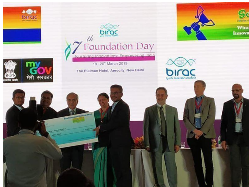
Grand Winner of BIRAC National Innovation Challenge for the Innovation Senio Care- A smart Phone based Breast Cancer Early Screening Device .