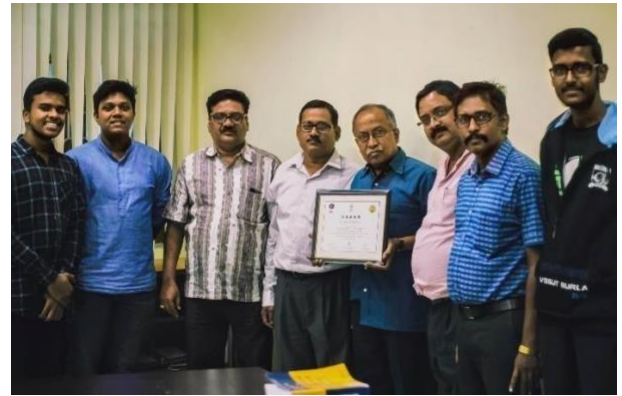
Inauguration of MHRD Ministry of Human Resource Development, Government of India Innovation Cell at VSSUT, Burla on 21 st November 2018.