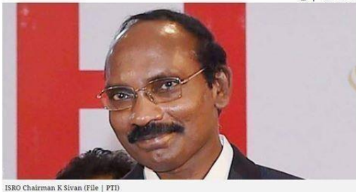
ISRO Chairman K Sivan

Published: 13th January 2019 02:40 AM | Last Updated: 13th January 2019 06:39 AM