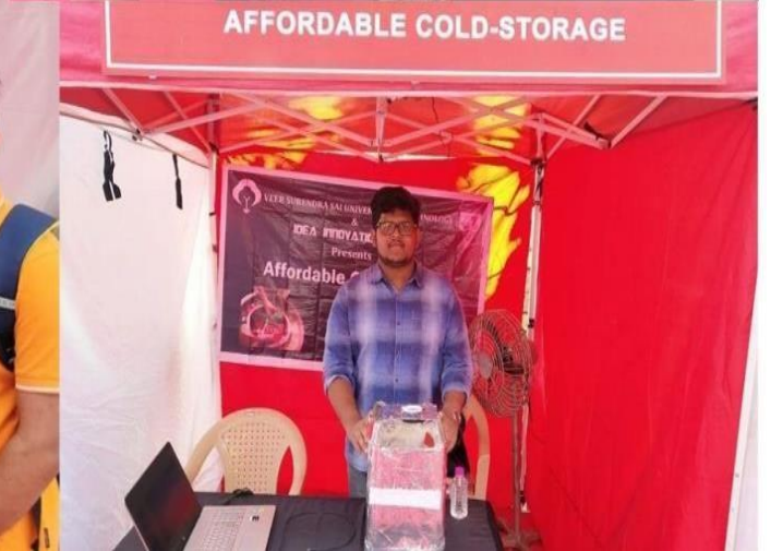
Two teams of VSSUT, Burla comprising of 4 sophomores made it among the top 100 makers of India represented at MAKER MELA 2020, this year.