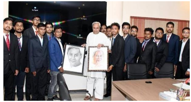
The Idea Club of VSSUT Burla presented several innovations and StartUp to Hon'ble Chief Minister Odisha Shri Naveen Patnaik , at Odisha Secretariat on 20 March 2018.