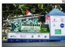
A tableau with a rocket on display at the Republic Day parade in Bhubaneswar on Saturday

Idea Club, a group of students from different departments of VSSUT, worked on the rocket along with the launching vehicle. The university claimed it is India's first indigenously built multi-purpose rocket developed and launched by a student club.