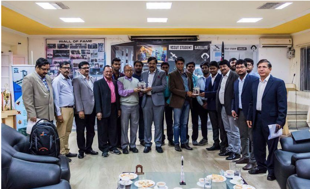
VSSUT Student Satellite team Interaction with Team Hon'ble ISRO (Indian Space Research Organisation) Scientists on 20 th December 2018.