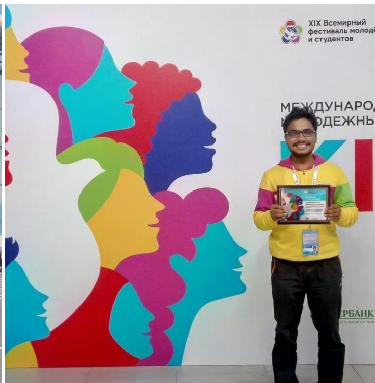
Team from Idea Club, VSSUT awarded at Sochi Olympic Park, Russia