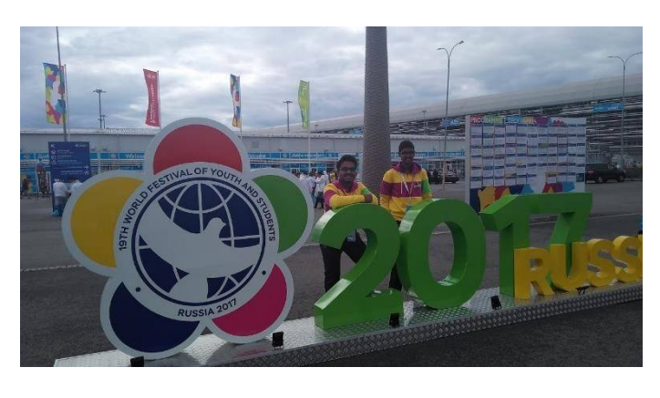
Winner of 15 Lakhs award in DST Birac Innovation Challenge and Student Winners at Sochi Russia World Youth Festival