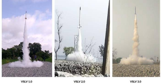
VSLV 1.0 22 August 2017 08:15 AM IST